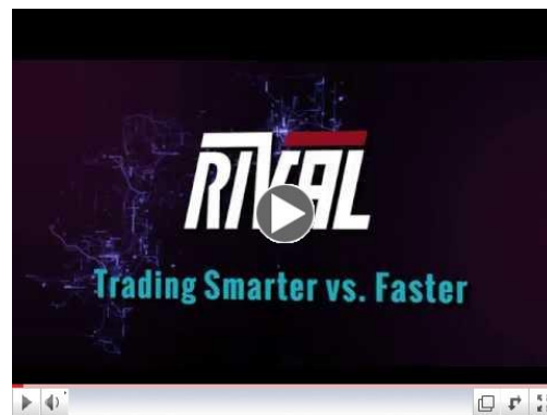
Rival Me This | Trading Smarter vs. Faster